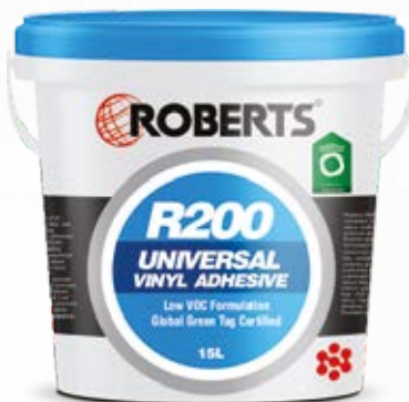
| R200 Multi purpose vinyl adhesive