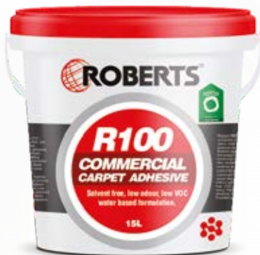
| R100 Commercial carpet adhesive

The world's best eco products Certified !