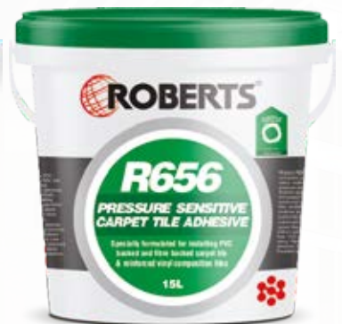
| R656 Pressure sensitive carpet tile adhesive