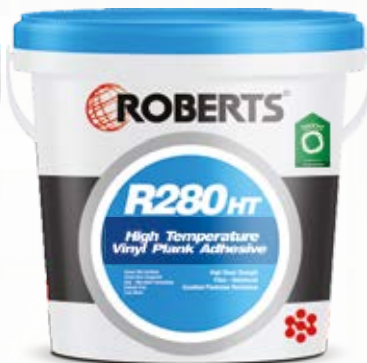
| R280HT High temp vinyl plank adhesive